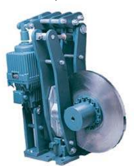
Heavy Duty Disc Brake