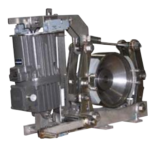
Mill Duty Shoe Brake